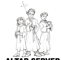
ALTAR SERVER A JOB SO BIG ONLY A KID CAN DO IT

takes place every Sunday at the 9:30AM Mass. All children are invited from the altar to the sacristy to share in a child-like presentation of the Readings of the Day. They return after the Prayer of the Faithful. Parents and older siblings are encouraged to accompany younger children.